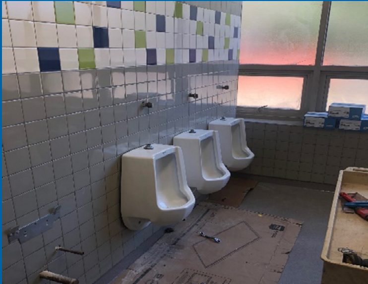
SW Wing Plumbing Fixture Installation