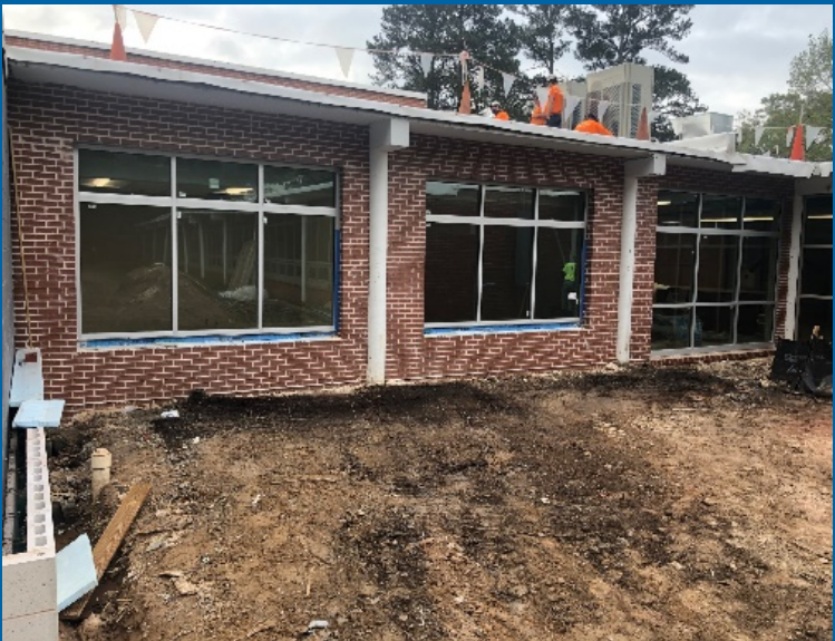
Storefront/Glass and Brick at Admin.