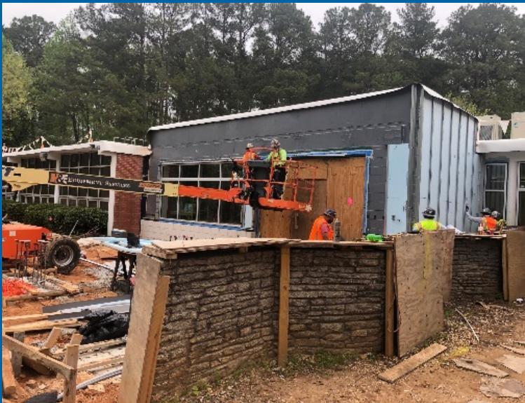
Main Entrance Storefront and Metal Panels