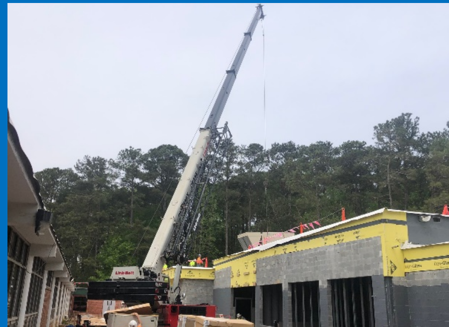
HVAC Equipment Set at Classroom Addition