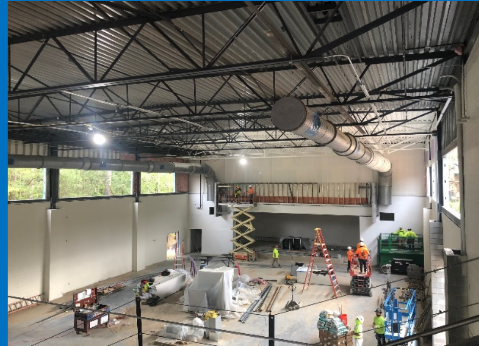
Gymnasium Interior Progress