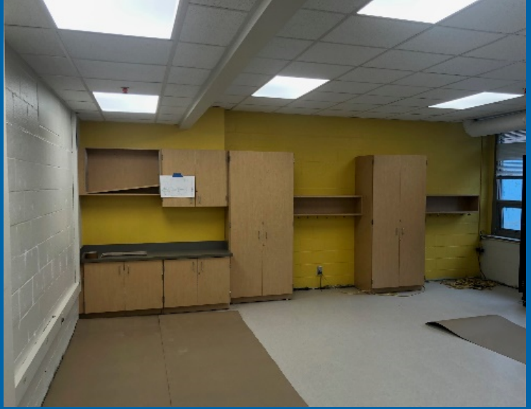
East Wing Casework